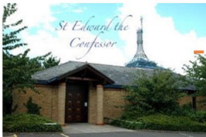
'The Search for Happiness' 27/11/22 St Edward the Confessor