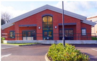
'The Power of Prayer' 18/12/22 Our Lady of Lourdes